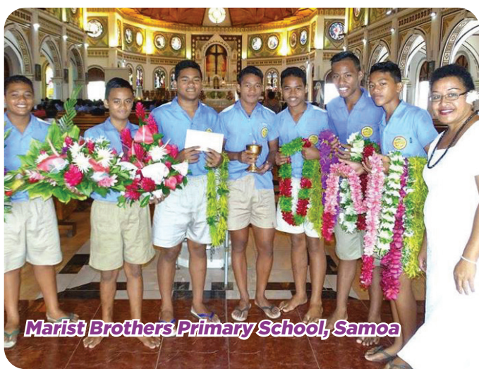
Marist Brothers Primary School, Samoa