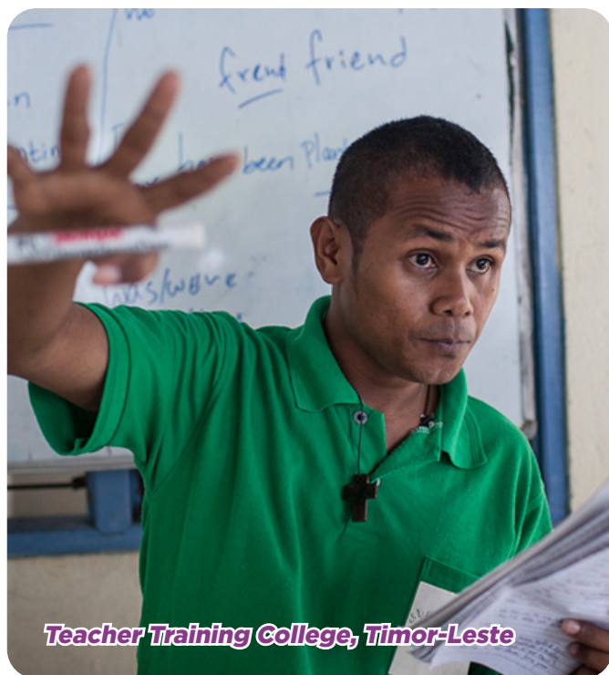
Teacher Training College, Timor-Leste

The Marist dream includes women and men, religious and lay, with the intention of making the love of Jesus Christ known in the world by care and compassion among the young, especially the most neglected. Today, the Marist family is present in 81 countries with tens of thousands of Marists working with over half a million young people in schools and in other pastoral and social ministries.