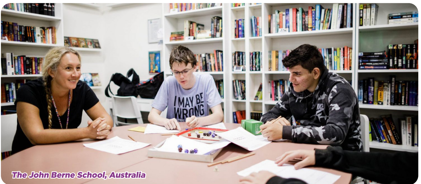
The John Berne School, Australia

(International Commission on Marist Mission, July 2021)