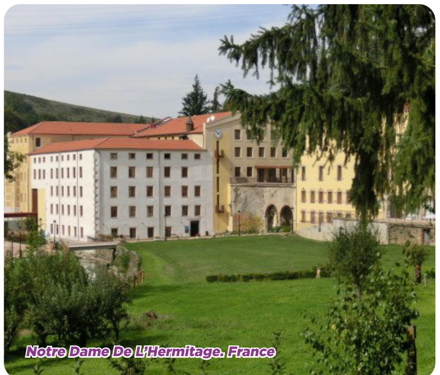
Notre Dame De L'Hermitage. France