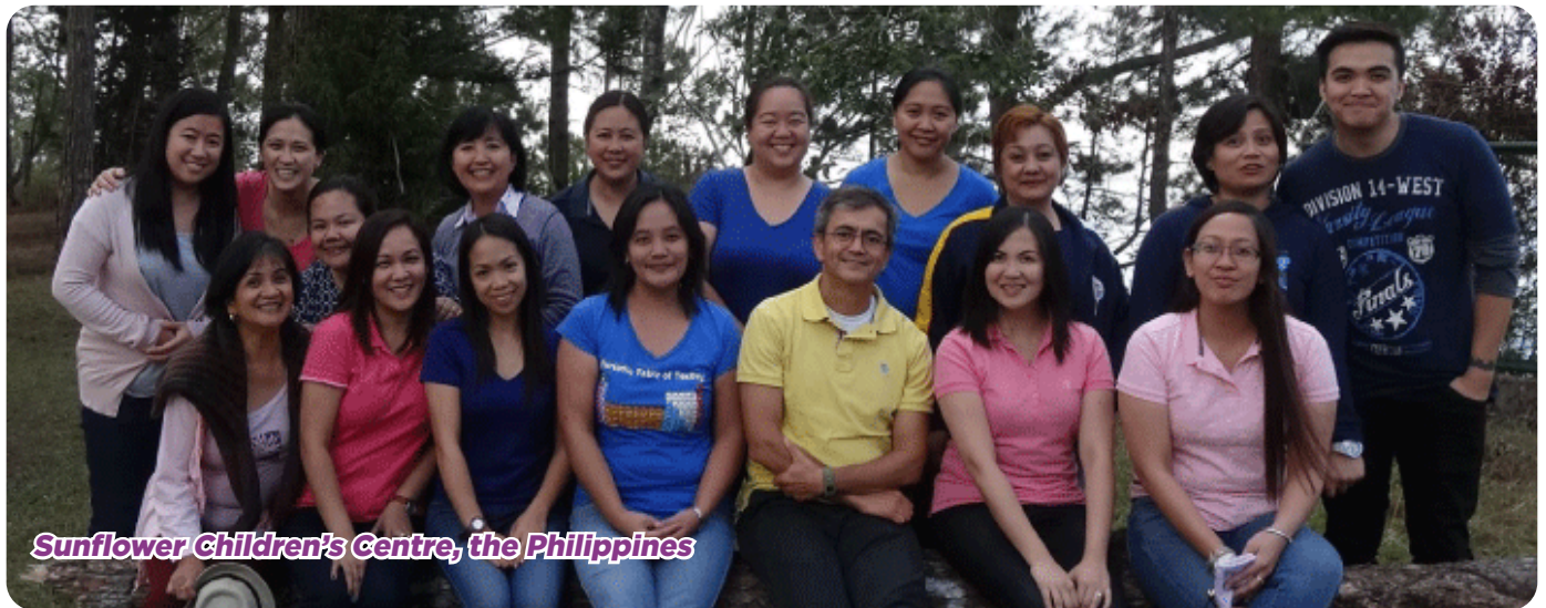
Sunflower Children's Centre, the Philippines