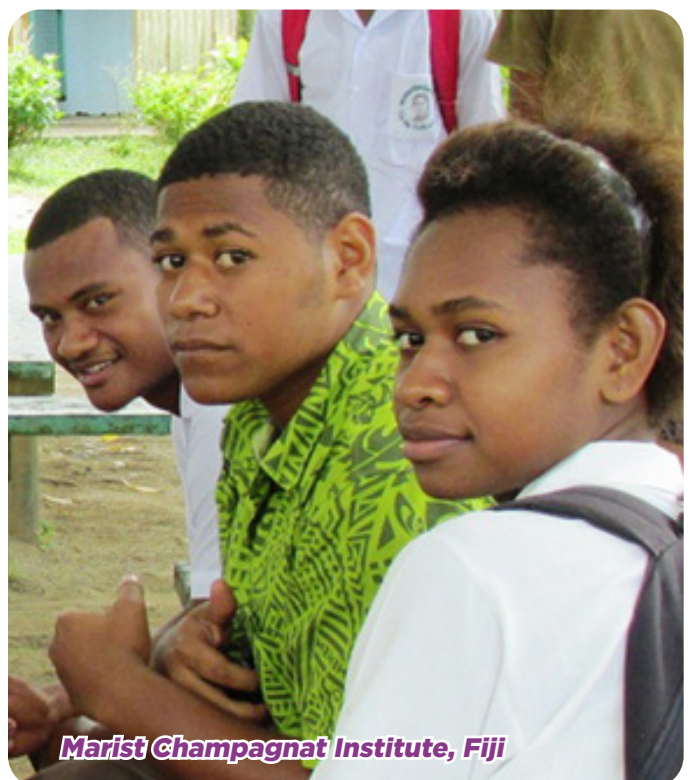
Marist Champagnat Institute, Fiji