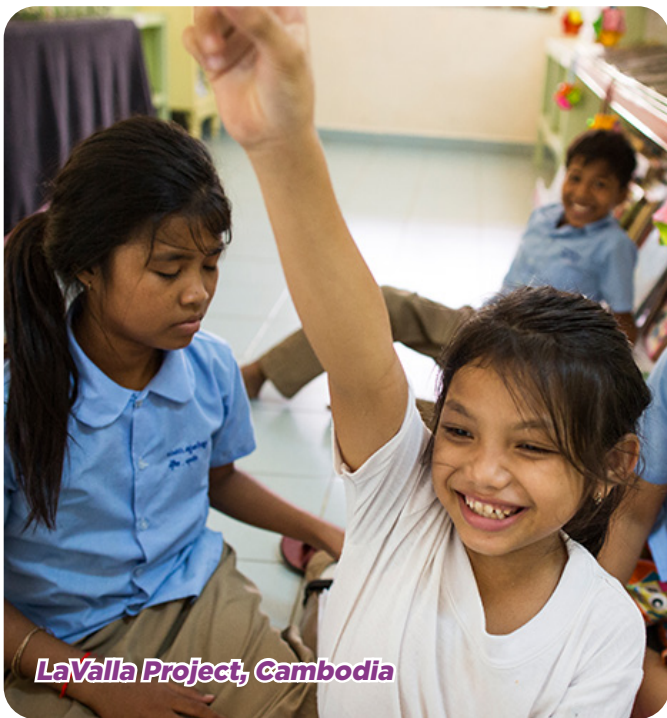
LaValla Project, Cambodia

Marist spirituality is defined by our search for God and meaning in our lives, in our relationships with each other, with creation, and the desire to share the Gospel message of Jesus. The story of our spirituality is one of passion and compassion, passion for God and compassion for people. ( Water from the Rock Marist Spirituality #1 )