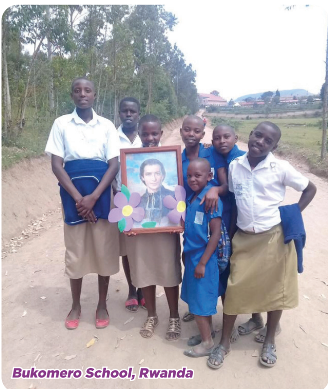
Bukomero School, Rwanda