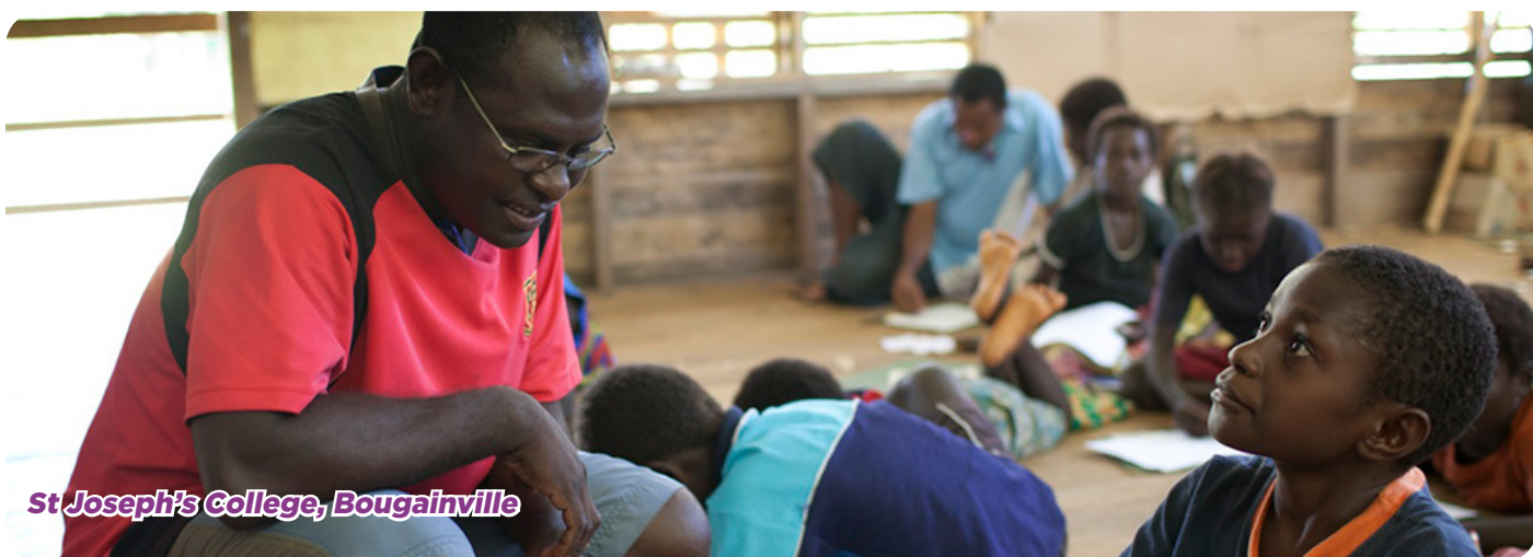
St Joseph's College, Bougainville