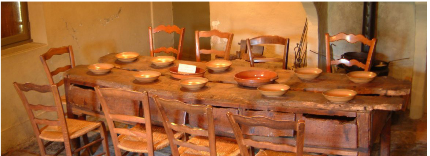
La Valla: The table built by Saint Marcellin – Champagnat – Marists of Champagnat

There is a place for everyone at Marcellin's table. When we gather around the table we speak, laugh and share time together. Everyone is invited to sit side by side, taking time to be truly present to each other.