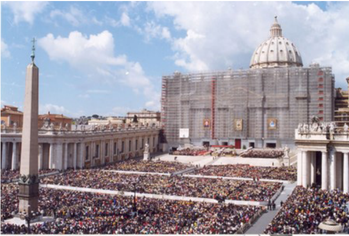
Canonisation of Fr Champagnat, St Peter's Basilica Vatican City, 18 April 1999.

We are now a couple of generations into using the title 'Saint' Marcellin Champagnat, but it's worth remembering that just 25 years ago there was a great deal of excitement across the whole Marist world about Fr Marcellin's canonisation. In 1999 Saint Peter's Basilica was eerily clad in scaffolding and protective mesh, with enormous building cleaning and restoration works taking place in preparation for the Great Jubilee Year, the new millennium, 2000. I remember thinking that the newly proclaimed Saint Marcellin probably would have felt 'at home' in what resembled a building site, given his life story of perpetual building and expansion.