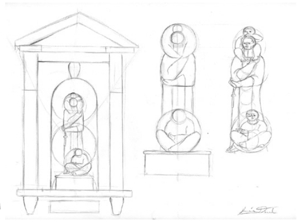
Original sketches by Jiménez Deredia